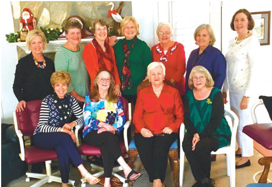
Members of the Brandywine Book Club enjoyed the annual Christmas luncheon.

The Brandywine Book Club met for our annual Christmas luncheon in December. We didn't discuss a book at that meeting but enjoyed a lovely lunch and social time with each other. The ladies also generously brought books to donate to Toys For Tots. At our meeting in January, we discussed the best-seller, Educated , by Tara Westover. What an incredible story! If you haven't read it, be sure to get a copy. In February, we will be discussing The Last Child by John Hart. It is the thrilling story of a man's search for his missing twin sister. Our March book is Leaving Time by Jodi Picoult. She always writes wonderful mysteries with lots of twists and turns that keep you guessing.